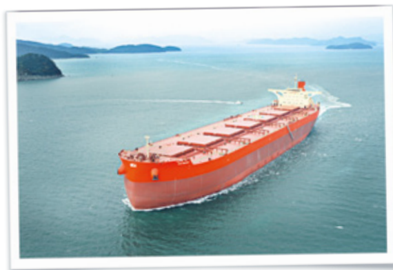
Cargotec provides MacGregor steel structures for diverse vessel types.

We provide steel structures for bulk carriers, container ships and general cargo ships. Our product portfolio covers everything that is needed for an efficient ship-based cargo handling system.