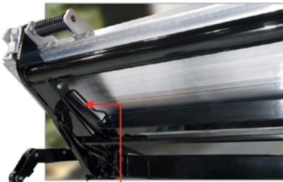
Lift cylinders store in a retracted position behind protective plating, shielding them from road debris that causes pitting.