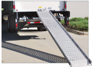
Optional walk ramp can be operated without moving the liftgate.