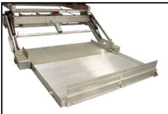
Optional Two-Piece Retention Ramp in the "up" position

Waltco Sales T: 800.211.3074 F: 800.211.3075 Email: sales@waltco.com Web: www.waltco.com