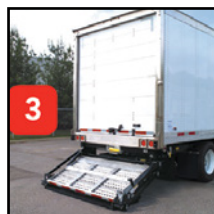
3 Manually Unfold Aluminum Extension