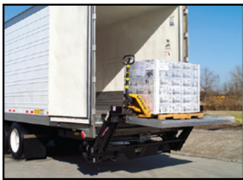
Stores completely underneath the trailer