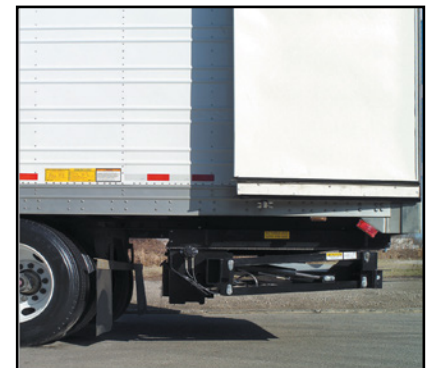
Mounting the GT requires only 64 1/2" behind the rear axle