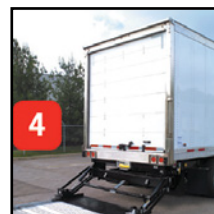
4 Liftgate Positioned for Cargo Loading