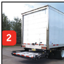
2 Powers Out from Under Trailer