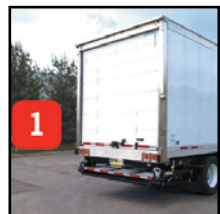
1 Stores Completely Underneath Trailer

Stored completely underneath the trailer, the GT Slide-Away Gate does not add to trailer length and requires no modification of trailer sills, OEM lights or door hardware.