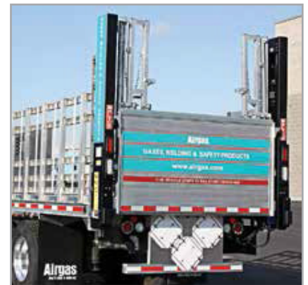
WDVBG Series Gate in stowed position