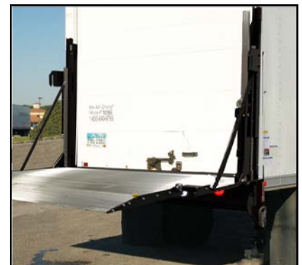
Above-floor, bed height view

Easier handling of wheeled carts, bins, and racks with this level-ride liftgate.