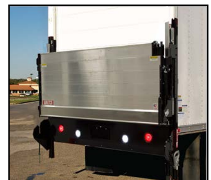
Gate shown in stowed position