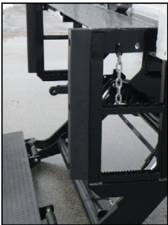
Optional Steel Dock Bumper with Built-in Traction Step and Full Coverage Rubber Pad