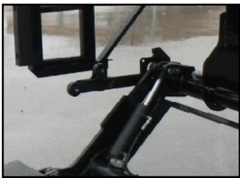
Bolt-on Parting Bar shown above.