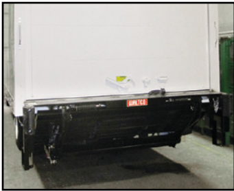
EM Series Gate in stowed position.