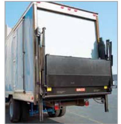
RGL Series Gate in stowed position

Increase productivity with simplified handling of bulky, wheeled, and palletized loads.