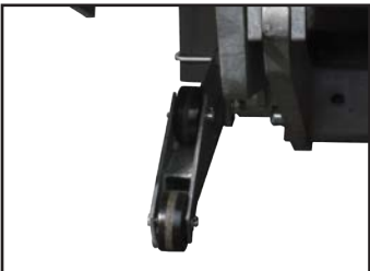
Bolt-on Parting Bar shown above.