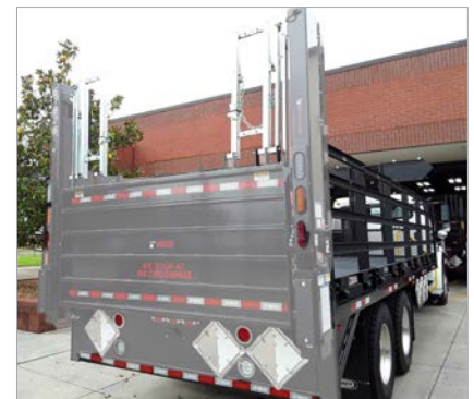
WDVBG Series Gate in stowed position