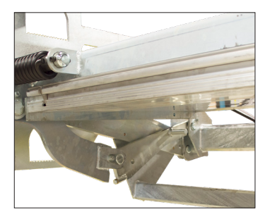
Waltco's slim design offers maximum platform width to fleets and is pallet jack friendly for the operator

Waltco Lift Corp. Corporate Office United States 285 Northeast Ave. Tallmadge, OH 44278 P: 330.633.9191 F: 330.633.1418