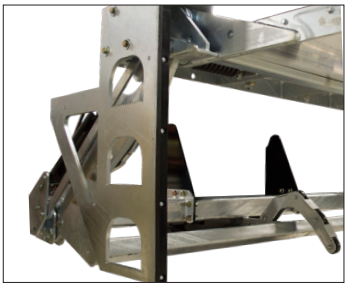
UHMW wear pads withstands harsh weather and road conditions and helps protect the liftgate from dock damage