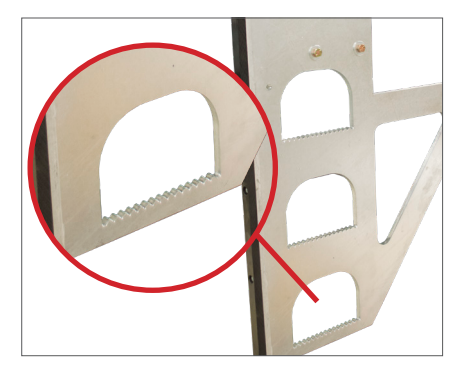
The WFL features a fully galvanized, rigid 3-step bolt-on bumper for added safety and convenience.

Platform remains level as it lowers from bed level to ground level