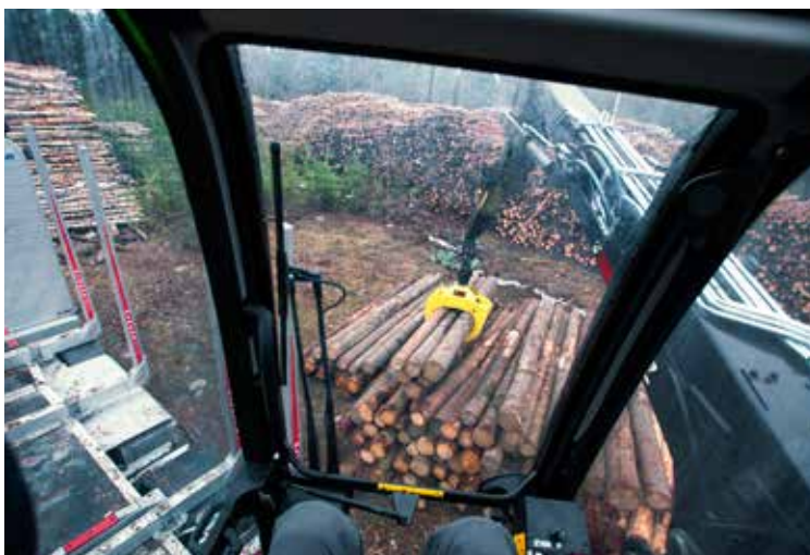
Gain panoramic views with Hi-Vis.

Incredibly tough, the shockproof front door is OPS tested for ISO 8084:2003 standard, and greatly reduces the risk of injury if anything impacts the door.