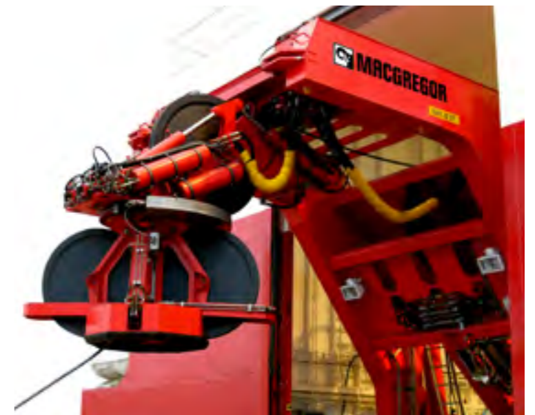
LARS expand the operational weather window in the harshest environments