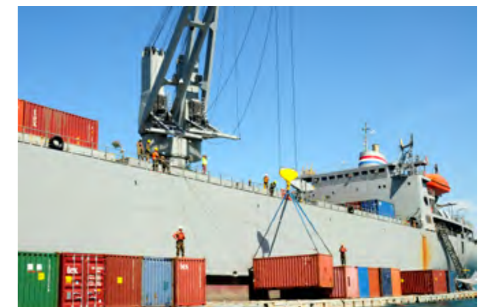
MacGregor's unique cargo handling aid cancels out swing motions when cranes are transferring cargo between moving or stationary locations

Similar sensors are placed on the target vessel and APC uses motion data from both vessels to make cargo landing and lifting operations as smooth and safe as possible. APC can be used with or without RBTS/IRBTS.