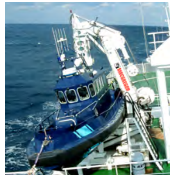
Rescue davits are designed for easy installation, efficient space utilisation and reliable, long-time operations in severe conditions

A-Frames can be either side- or stern-mounted. They are designed for a variety of load handling operations offshore, such as launch and recovery of special equipment, ploughing and trenching, deep ocean scientific operations and missions in hazardous environments.