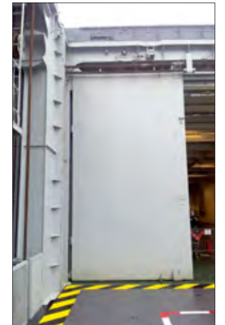
A hangar door