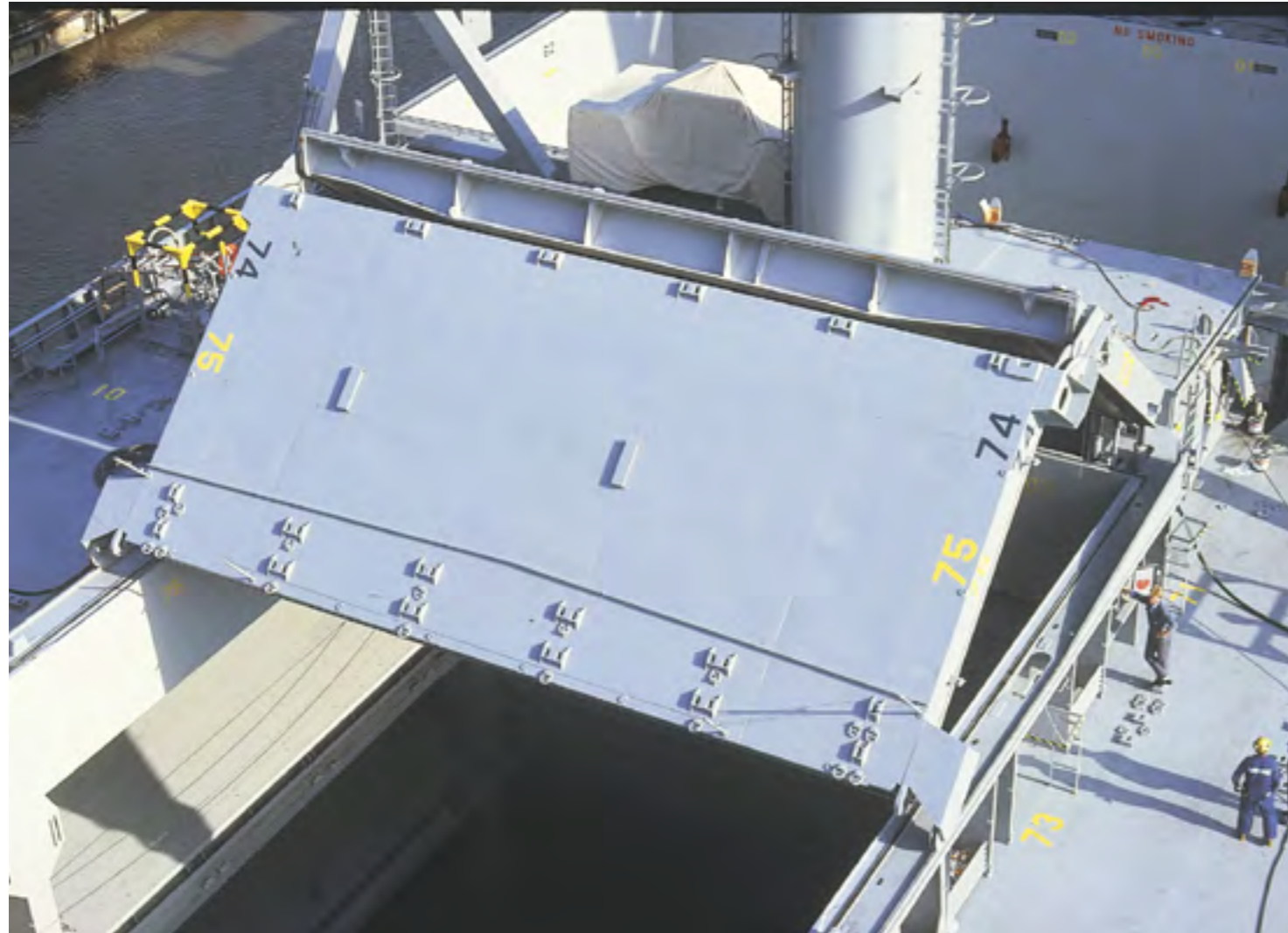
Hatch covers must meet two principal requirements: safety and ease of cargo handling operations