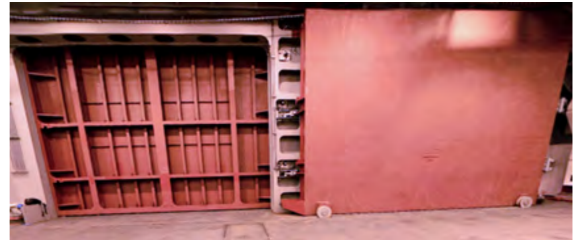
MacGregor sliding bulkhead doors fulfil SOLAS requirements onboard RFA Argus.

MacGregor's modernisation solutions are a cost-effective way of enhancing or modifying ships to meet changing market requirements. It can be a retrofit or an upgrade; replacement, addition or alteration of an existing cargo flow system.