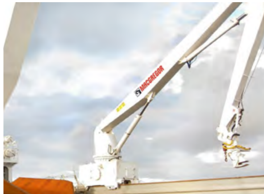
Cargo rail crane outfitted with a deck handling manipulator for safer and more flexible operations on the aft deck