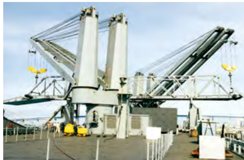
Two sets of twin cranes in a quadralift team operation

MacGregor shipboard cranes can be mounted on a CRV (cargo-rail vehicle) trolley system, which enables them to travel along the cargo rail covering the entire length of the aft deck on offshore vessels. These cranes can also be fitted with various manipulators for specific deck operations. Robust and extremely smooth to control via remote control system, our cranes give the operator a new tool for safer deck operations.