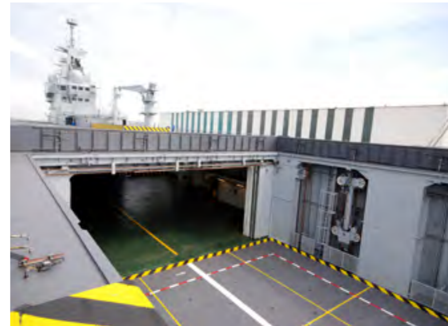
A helicopter lifting platform on board Landing Helicopter Dock (LHD) Dixmude BPC3.