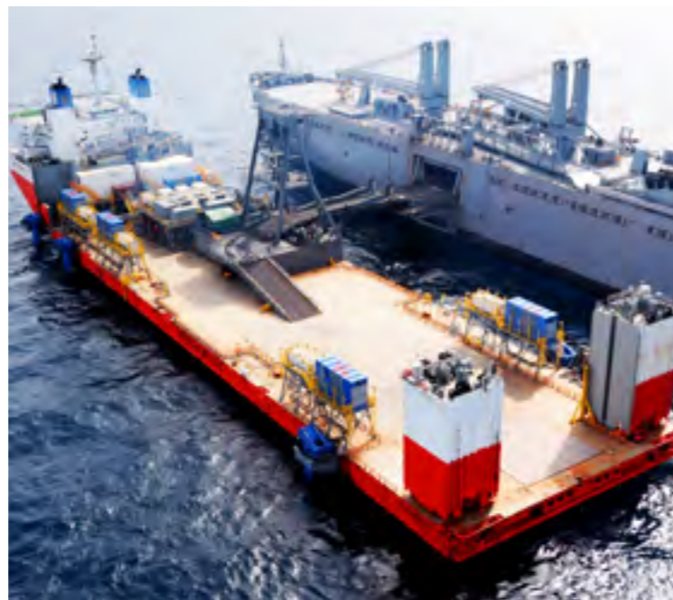
The Test Article Vehicle Transfer System (TAVTS) demonstrates transfer of vehicles between ships at sea