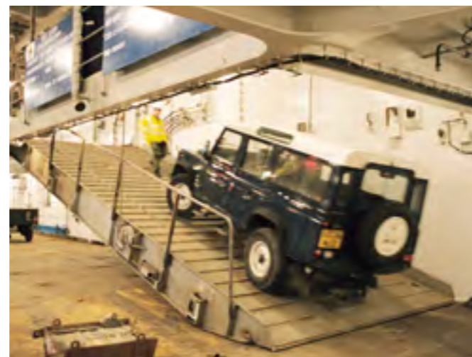
An internal hoistable ramp