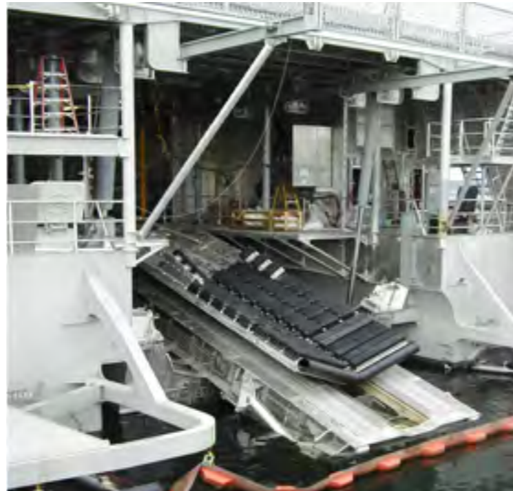
An RHIB launch and recovery system

Heave compensation mode is employed and laser sensors measure and maintain the spatial and correct relationship between the ramp foot and the platform. During US Navy's full-scale sea trials, personnel and vehicles such as a 70-tonne battle tank were successfully transferred between the ships in high Sea State 3 and low Sea State 4.