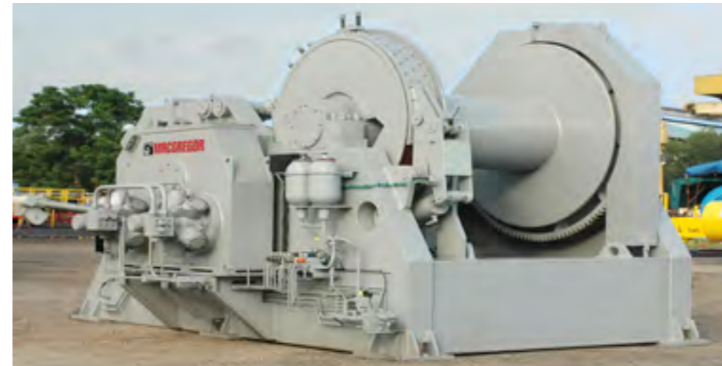
An anchor handling winch.

In addition, we offer a wide range of optional equipment and provide tailor-made solutions in accordance with client's specifications to accommodate any ROV/T.